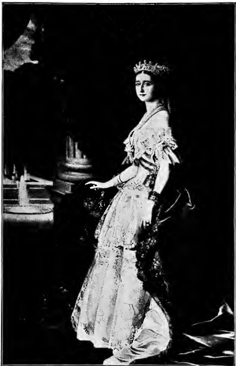
THE EMPRESS EUGÉNIE.